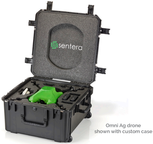
Omni Ag drone shown with custom case