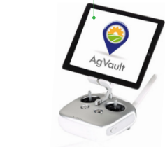
White controller to fly Omni Ag Drone and control DJI Payloads