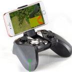
Black controller to maneuver Double 4K sensor

It's easy—anyone can operate this solution. Each Omni Ag package comes with two controllers: one controller to maneuver the Double 4K sensor, and one controller to manually fly the Omni drone and control a DJI payload. When manually flying the drone, both controllers will be used and two people are needed, one to operate each controller. When flying autonomously, number of operators needed will depend on which payloads are used. Smart devices sold separately.