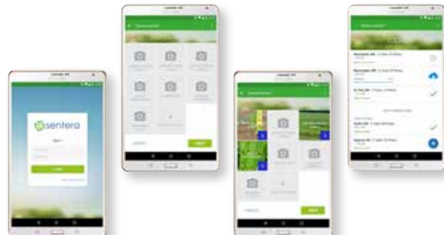
Sentera AgVault mobile app