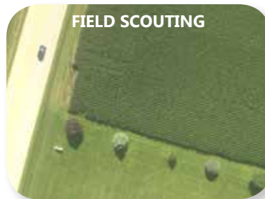
Imagery output from a Sentera Double Sensor