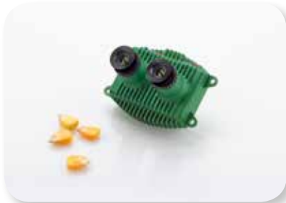
Sentera Double Sensor

The Lockheed Martin Indago™ AG and Sentera Double sensor work in concert together, enabling a grower to unlock the full capabilities of advanced crop assessment, previously unavailable in the agriculture industry. The Sentera Double captures normalized difference vegetation index (NDVI) and high-resolution color imagery in a single flight, decreasing time spent in the air. The information is collected with precision and is an integral part of how growers make input decisions, enabling them to increase crop yields while being good stewards of the land and environment.